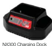
NX300 Charging Dock