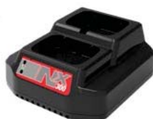
NX300 Dual Charging Dock